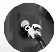
Quick draining connection