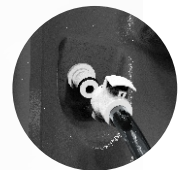
Quick draining connection